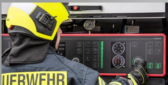
Control and Operation