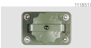
NATO emergency start socket for jump-starting