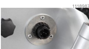
FireCAN interface for standardized communication