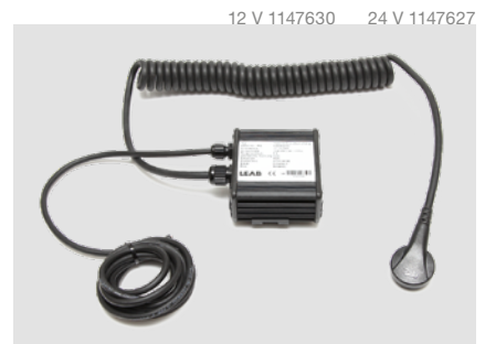
Vehicle installation kit MagCode as 12 V or 24 V version