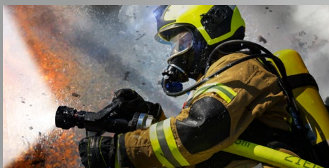
Hoses and Equipment