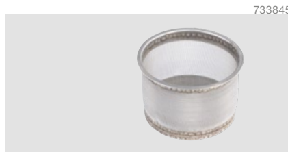
Protective strainer against foreign objects in the fuel tank