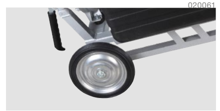
Transport unit for easy pump transportation by one person