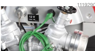
Charge retention 230 V with constant monitoring