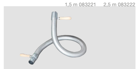
Exhaust extension hose with a length of 1.5 m or 2.5 m