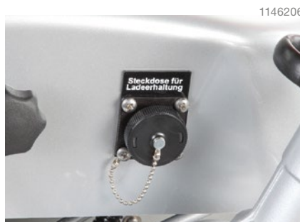
Three-pole BEOS screw socket for constantly monitored charge retention