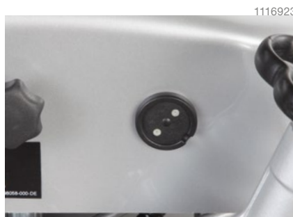
MagCode magnetic coupling socket for charge retention