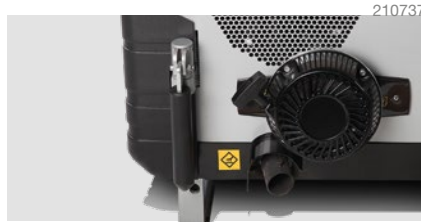
Recoil starter for manual emergency start