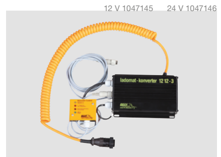
Vehicle installation kit BEOS as 12 V or 24 V version